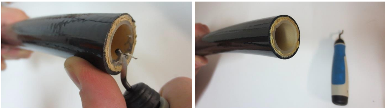
Use a proper tool to remove burrs and/or residual from the cut surface.

In addition, assembly flushing can be performed, depending on the degree of cleanliness required in your application and on your standard procedures.