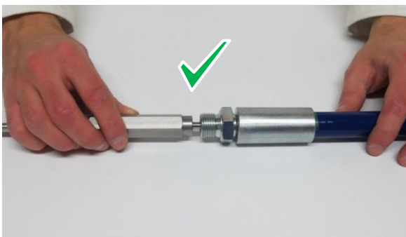
1. Go side must slide through the whole length of the insert