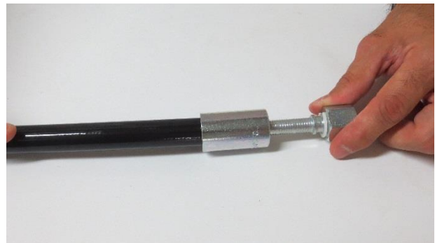
Marking the insertion depth of the ferrule and then put insert into the hose.